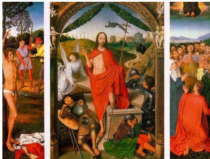
Triptych of the Resurrection, Hans Memling, 1490. Musée du Louvre, Paris, France.

I am the good shepherd. The good shepherd lays down his life for the sheep. The hired hand, who is not the shepherd and does not own the sheep, sees the wolf coming and leaves the sheep and runs away—and the wolf snatches them and scatters them. The hired hand runs away because a hired hand does not care for the sheep. I am the good shepherd. I know my own and my own know me, just as the Father knows me and I know the Father. And I lay down my life for the sheep. I have other sheep that do not belong to this fold. I must bring them also, and they will listen to my voice. So there will be one flock, one shepherd.