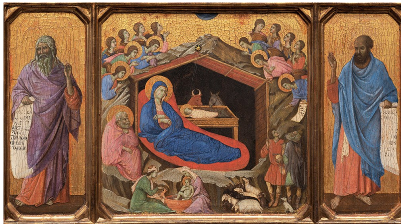
Duccio di Buoninsegna. The Nativity with the Prophets Isaiah and Ezekiel . 1308-1311. National Gallery of Art, Washington, D.C.

You, mortal, I have made a sentinel for the house of Israel; whenever you hear a word from my mouth, you shall give them warning from me. If I say to the wicked, “O wicked ones, you shall surely die,” and you do not speak to warn the wicked to turn from their ways, the wicked shall die in their iniquity, but their blood I will require at your hand. But if you warn the wicked to turn from their ways, and they do not turn from their ways, the wicked shall die in their iniquity, but you will have saved your life.