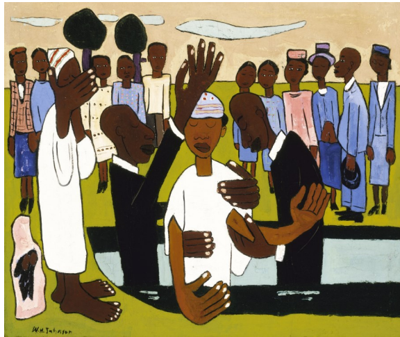
I Baptize Thee , William H. Johnson. 1940. Smithsonian American Art Museum, Washington, D.C.

of the Holy Spirit had been poured out even on the Gentiles, for they heard them speaking in tongues and extolling God. Then Peter said, “Can anyone withhold the water for baptizing these people who have received the Holy Spirit just as we have?” So he ordered them to be baptized in the name of Jesus Christ. Then they invited him to stay for several days.