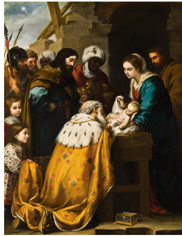
(l) Giotto. The Adoration of the Magi . Cappella Scrovegni a Padova. Padova Italy. 1305; and (r) Bartolomé Esteban Murillo. Adoration of the Magi . 1660.